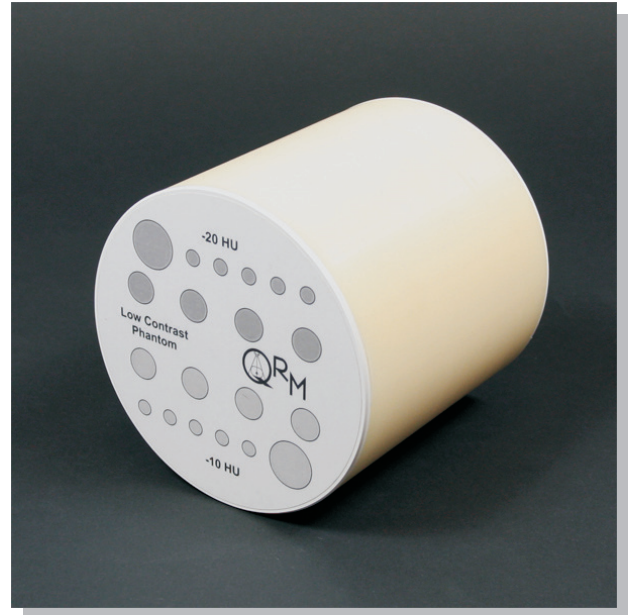
2DL with different contrast cylinders of -10 HU and -20 HU!

Accuracy ..... \pm 1 HU of specified values