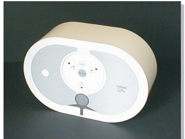
QRM-Thorax with Cardio Calcification Insert

The cylindrical cardiac calcification insert, QRM-CCI , contains nine cylindrical calcifications in varying size and hydroxyapatite (HA) density (see Table next side), and two larger calibration inserts. One of them is made of water equivalent material, the other one contains hydroxyapatite in addition. They are embedded in a tissue-equivalent solid of typically 35 HU (+/- 5 HU) at 120 kV.