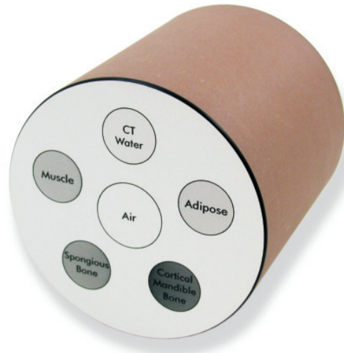
Electron Density Phantom (QRM-EDP)

Yohannes I, Kolditz D, Langner O, Kalender WA; A formulation of tissue- and water-equivalent materials using the stoichiometric analysis method for CT-number calibration in radiotherapy treatment planning; Phys. Med. Biol. 57 (2012) 1173-1190.