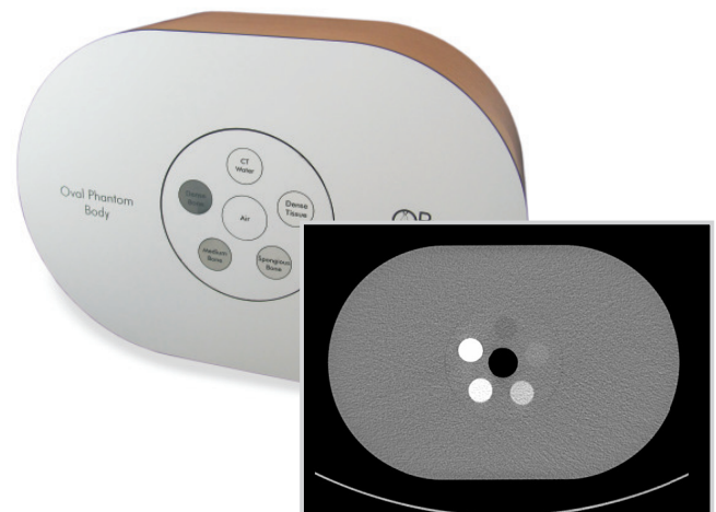
QRM EDP placed in optional available water equivalent Oval Phantom Body