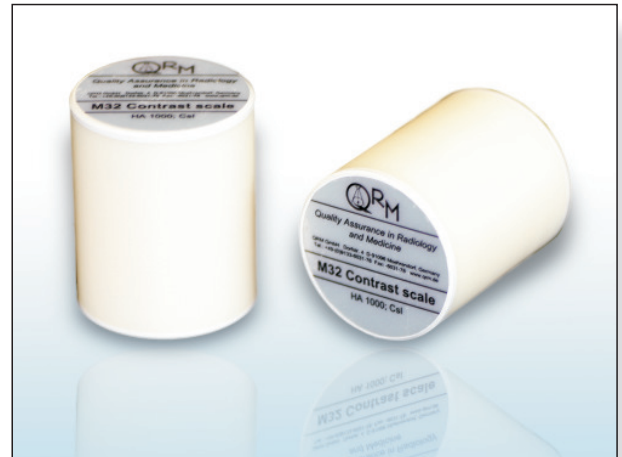
Micro-CT Contrast Scale Phantom.