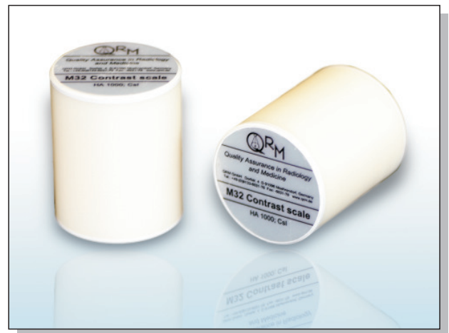
Micro-CT Contrast Scale Phantom.