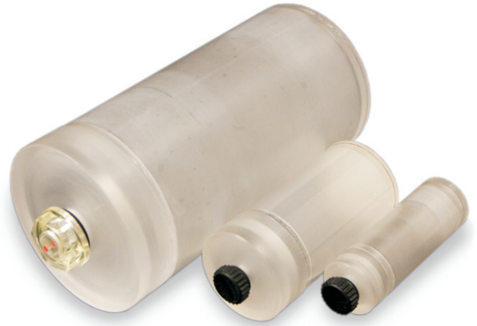
Standard versions (Ø 20, 32 and 60 mm) of the QRM Micro-CT Water Phantom