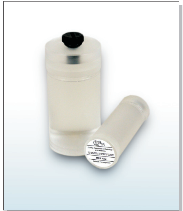
QRM Micro-CT Water Phantom