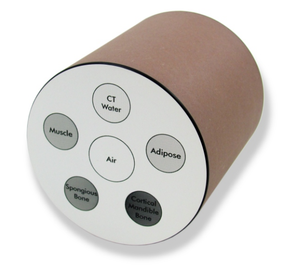
Electron Density Phantom (QRM-EDP)

Yohannes I, Kolditz D, Langner O, Kalender WA; A formulation of tissue- and water-equivalent materials using the stoichiometric analysis method for CT-number calibration in radiotherapy treatment planning; Phys. Med. Biol. 57 (2012) 1173-1190.