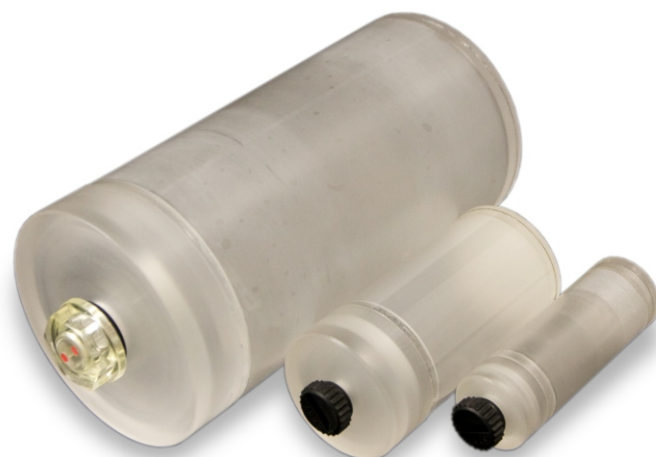
Standard versions (Ø 20, 32 and 60 mm) of the QRM Micro-CT Water Phantom