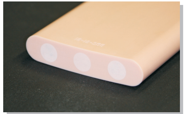
QRM-BDC Bone Density Calibration Phantom