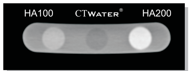
CT-image of the Bone Density Calibration Phantom