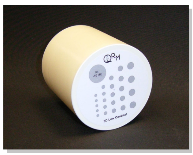
Contrast of -10 HU or -20 HU available!