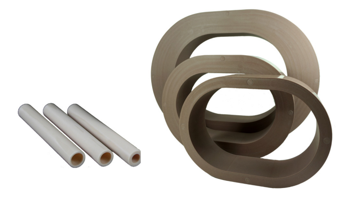
CT chamber adapters and Extension Rings with dose bores (and plugs)