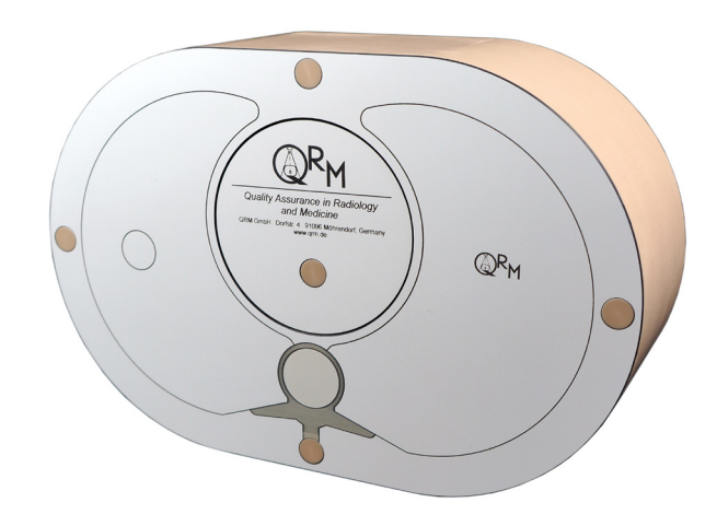
QRM-Thorax-Dosimetry (dosimetry bores filled with detachable plugs)

Phantom heights can be adjustet (e.g. 150 mm, 200 mm) upon demand.