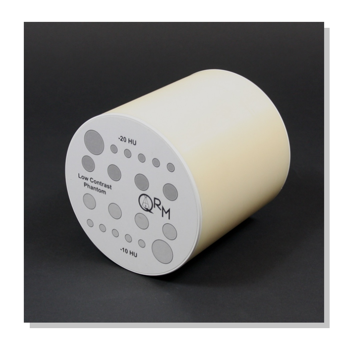
2DL with different contrast cylinders of -10 HU and -20 HU!

Accuracy ..... ± 1 HU of specified values